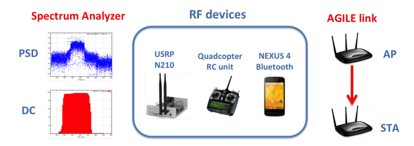
Figure 1: Experimental Topology in Scenario 1.