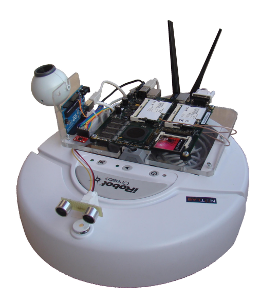
Fig. 1. Mobile node

is supplied power through the robot's own battery. The Alix board runs the Voyage Linux distribution, but it is able to run any light Linux distribution. The mounted camera is facing upwards and thus is used to recognize specific patterns that are placed on the ceiling, which provide the robot with the ability to detect its position and navigate around the room.