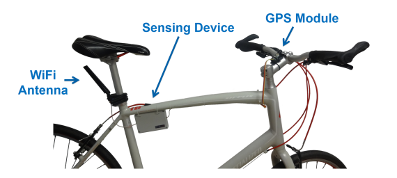
Fig. 3: NITOS mobile sensor node mounted on bicycle

ZigBee gateway: As already mentioned, we want a mobile node to be able to communicate with the RC not only via WiFi but also via ZigBee. The respective gateway, illustrated in Fig. 2(c), is custom built for this purpose. It is based on an Arduino Ethernet board, on top of which we mount a custom shield with an Xbee module. The Ethernet is connected to a backbone network through which the RC can be reached. The Xbee is configured as a coordinator for a given PAN id. When a node associates with the ZigBee network of the gateway, the gateway initiates a TCP connection to the RC on behalf of the node. From that point onwards, the gateway receives (over the Xbee transport) the protocol messages sent by the node, and forwards them (over TCP/IP) to the RC. The same is done for the messages flowing in the other direction.