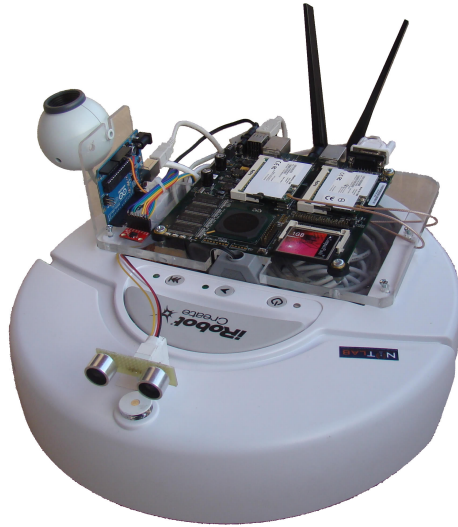
Fig. 1. Mobile node

is supplied power through the robot's own battery. The Alix board runs the Voyage Linux distribution, but it is able to run any light Linux distribution. The mounted camera is facing upwards and thus is used to recognize specific patterns that are placed on the ceiling, which provide the robot with the ability to detect its position and navigate around the room.