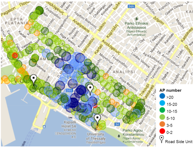
(a) Available WiFi Networks in Volos City.