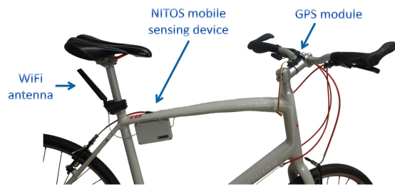
(b) NITOS Device mounted on Bike.